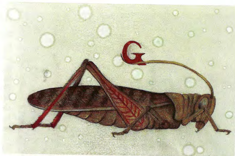
▲ CATAPULT: G IS FOR GRASSHOPPER, OIL, 10 X 15.

108 South Main St. Livingston, MT 406-222-0337 34 West Main St. Bozeman, MT 406-522-9946 1715 Wazee St. Denver, CO 303-292-0909