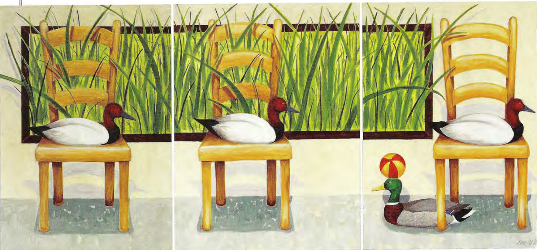
GET YOUR DUCKS IN A ROW, OIL, 40 X 90.

the editors' choice for up-and-coming talent